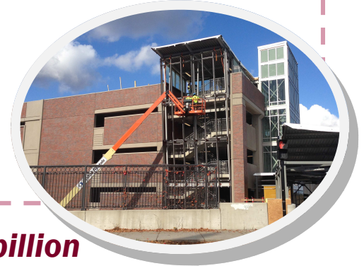
Salem's New MBTA Commuter Rail Station & Parking Garage opened on October 24th.

communication between those executing projects, and the residents, visitors, and businesses of our City.