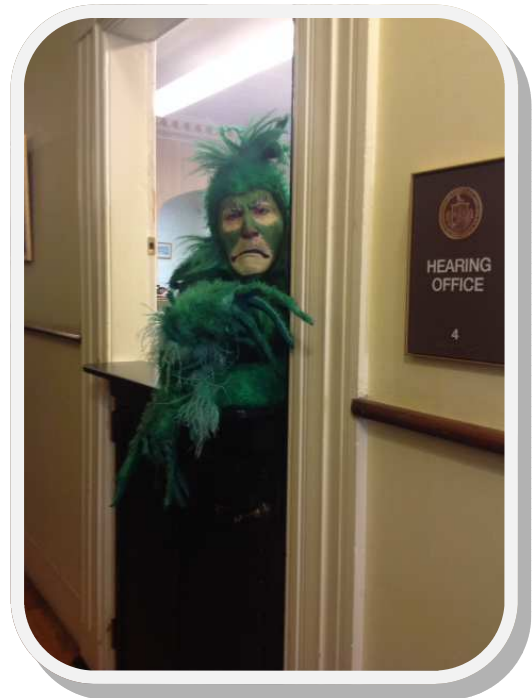
Grinch

Sign-Up for Salem News & Announcement Email Alerts about programs like this at Salem.com/Subscriber