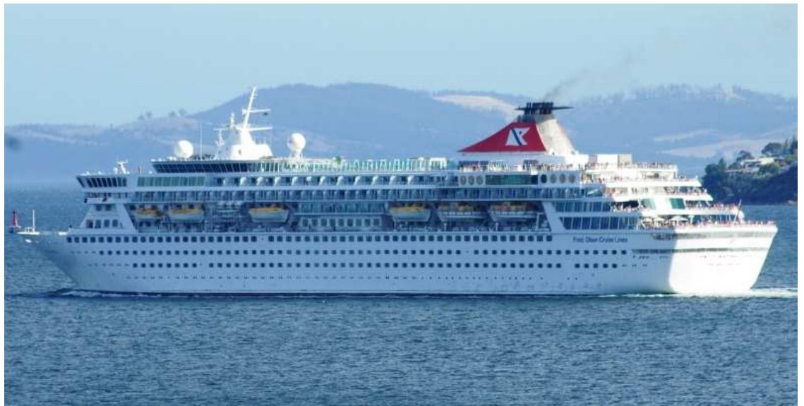
Balmoral Cruise Ship

This is just the beginning of the implementation of the overall Salem Harbor Plan.