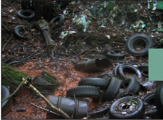
Tire and Drum Dump