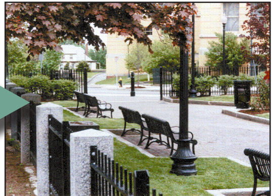
Potential Residential Housing and Open Space