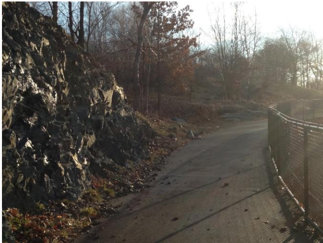
Pathway along northern side