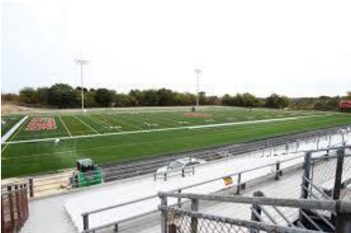
New Track/Lighting Bertram Field