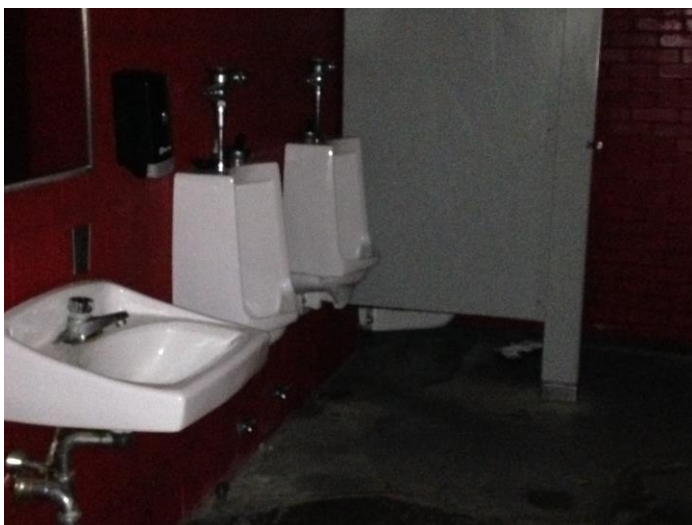
Current conditions of field house