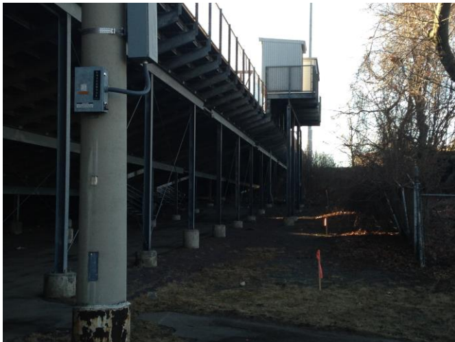
Behind Bleachers, western Side

(North Shore Medical Center Property Line)