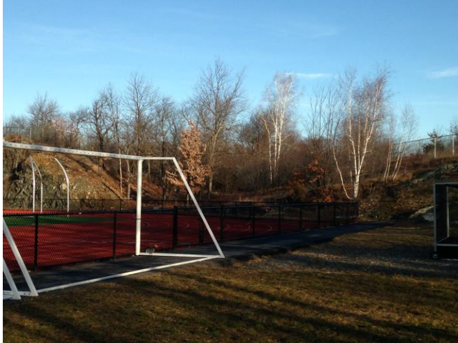
Ledge along northern side