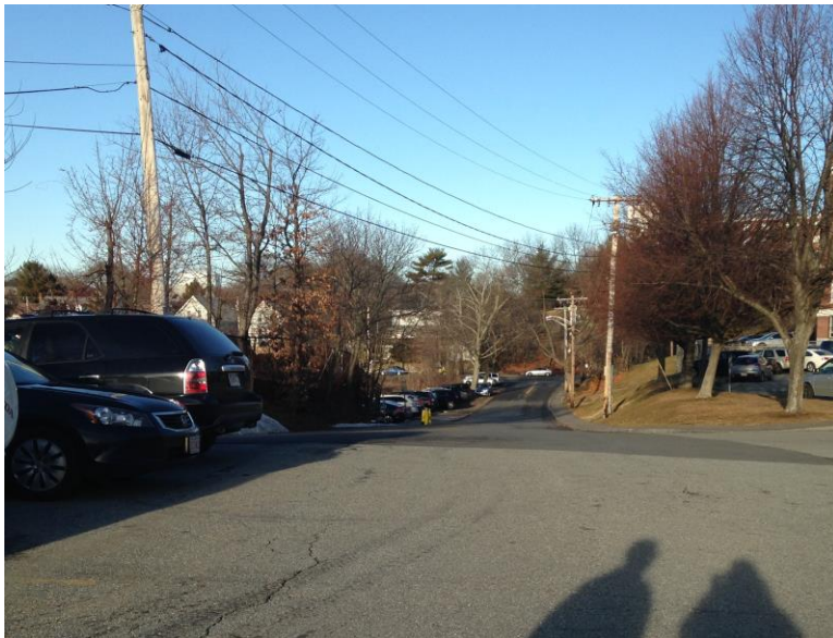
Powder House Lane