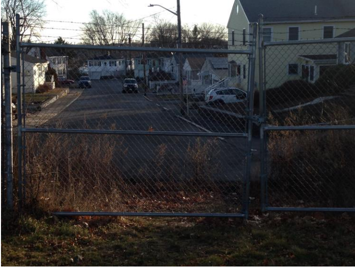
Bertucci Ave. emergency access