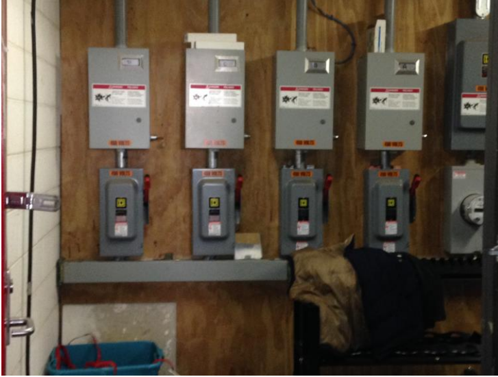
New Lighting Electrical Panels