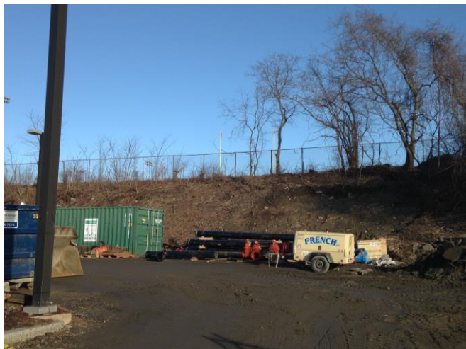
Southern side, North Shore Medical Center