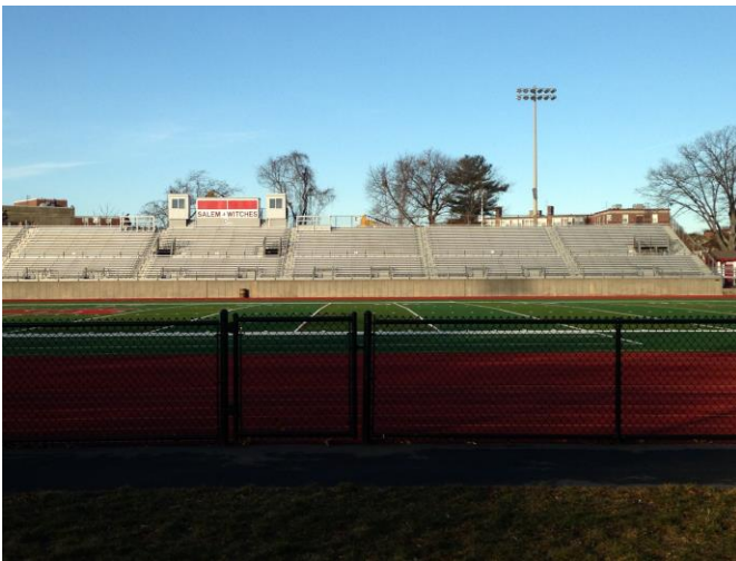
View from Bertucci Ave. east side of field