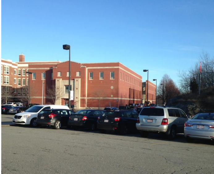
Parking Area /Collins Middle School