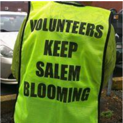
Our new BComm Vests!