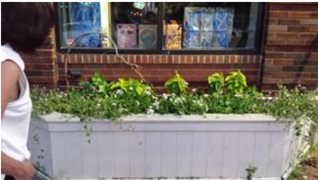
Denise and the SATV Window Box!