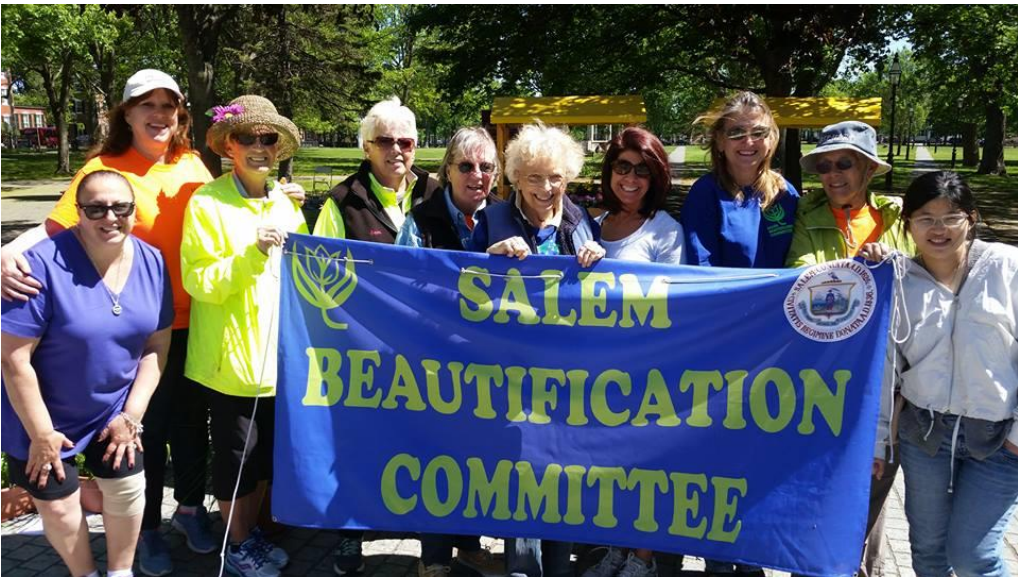
Team BComm 2017