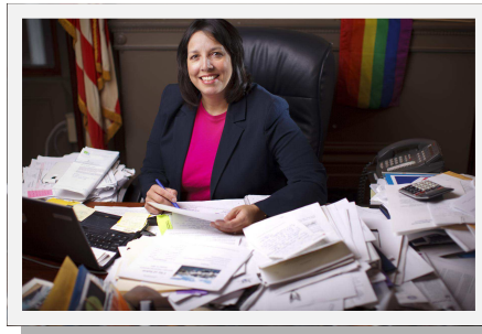
Bostonians of the Year: Honorable Mentions