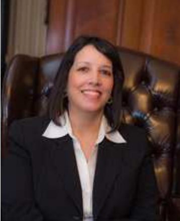
Dear Salem resident,

Thanks for reading the FYI Salem newsletter!