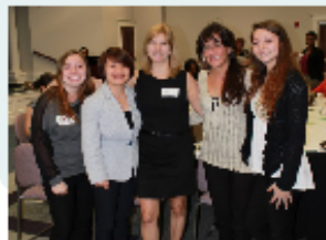
Mediclerk Reunion, Spring 2016

Tuition assistance may be available. For more information, please call 978-354-2495.